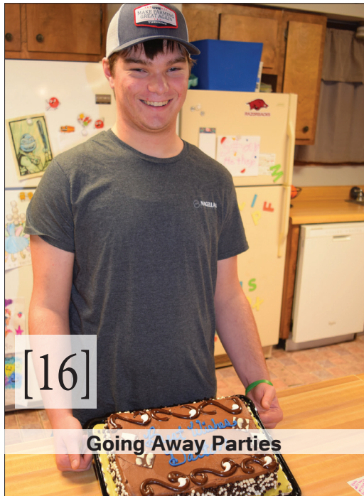
Going Away Parties

From the Executive Director .....4 'Never Forget Why You Do What You Do'