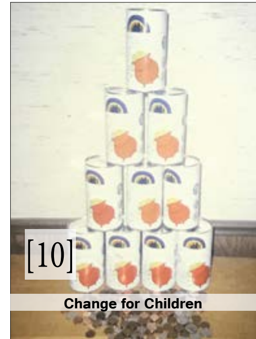
Change for Children

Safe Ministry Minute..... 13 Maximizing Your Children's Ministry Activities