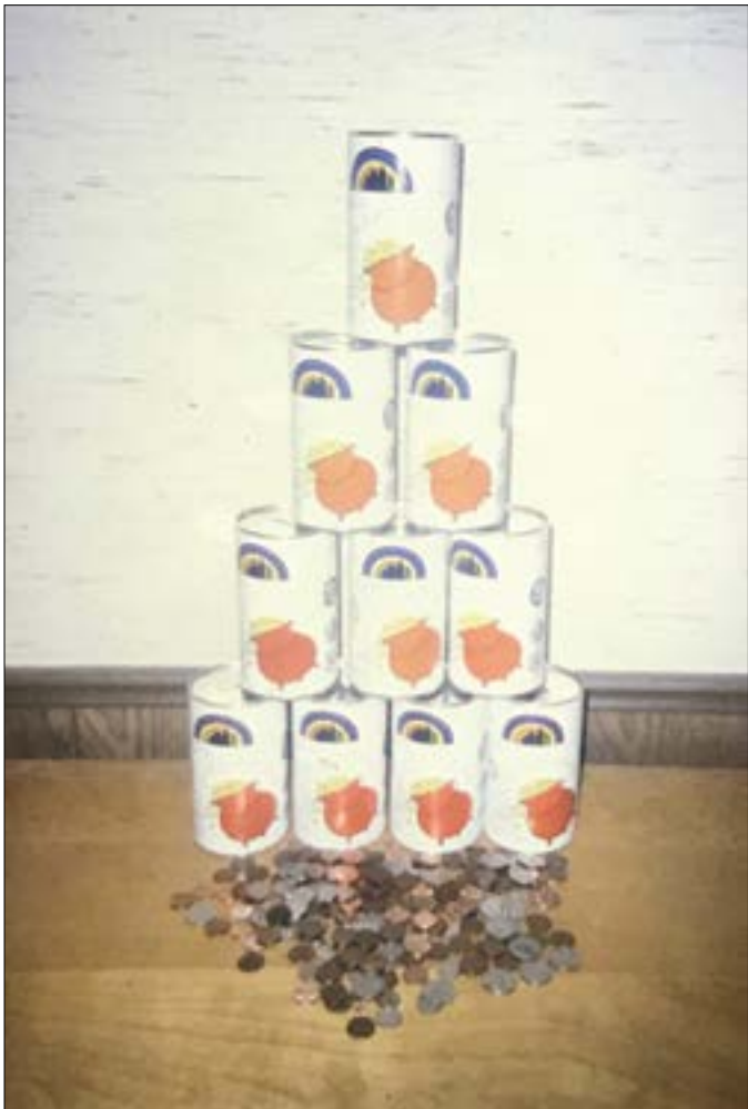
A photo from the 1980s of one of Children's Homes, Inc.'s first Change for Children coinbanks.

The Round-Up option allows our supporters to