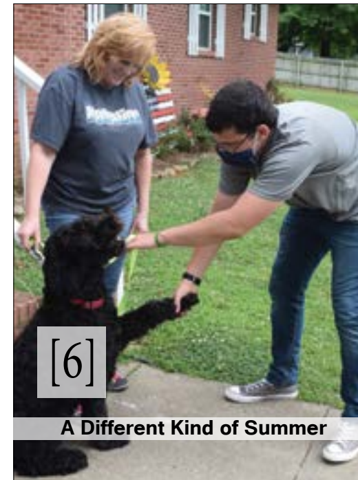
A Different Kind of Summer

From the Executive Director ..... 4 New Normal or Correct Normal?