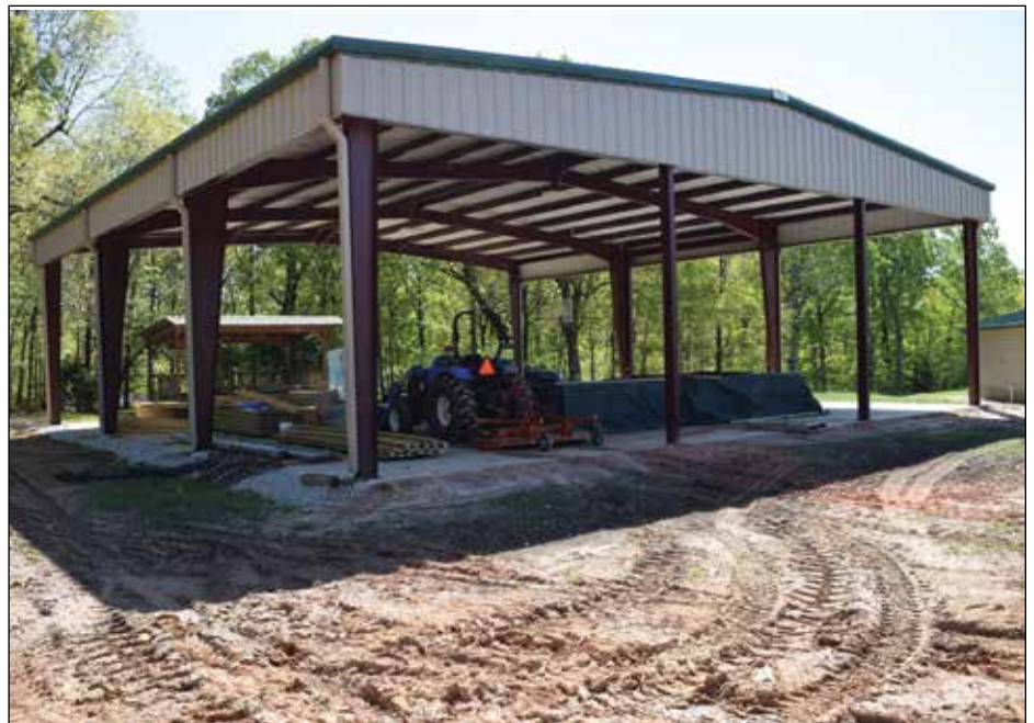
Another angle of the new pavilion.

Though the summer camp sessions are the most visible part of The Ridge's operations, we want to remind