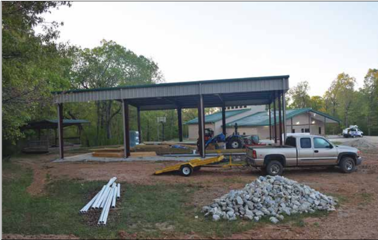
A side view of the new pavilion, relocated stage and new main building.