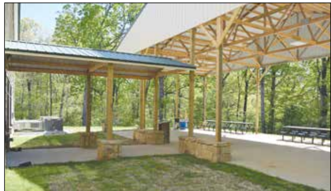
CLOCKWISE FROM TOP RIGHT: The dining area in the new main building; The patio area just outside the dining room; An alternate angle of the dining room; The wall where rafters from old cabins are on display; The kitchen in the new main building.