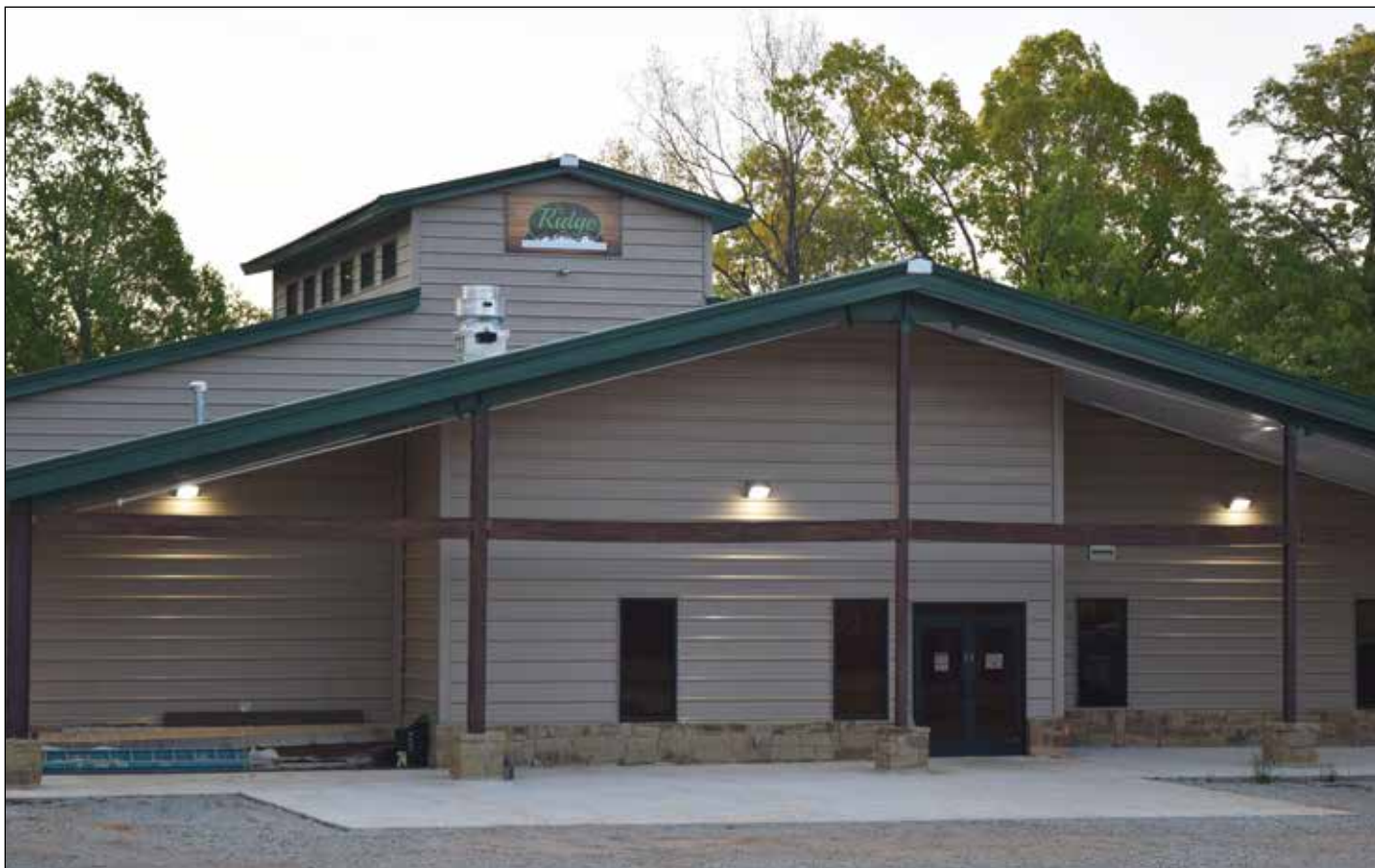
The new main building at The Ridge Retreat and Adventure Center just after daylight recently.