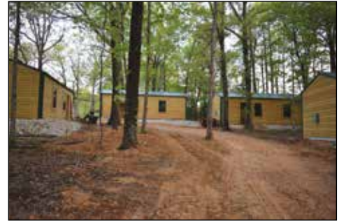
CLOCKWISE FROM TOP LEFT: A closeup of a single smaller cabin; The new boys' cabins; the new girls cabins.