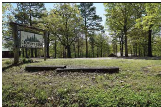
The old Crowley's Ridge Youth Camp main building was torn down last summer.

One of the more bittersweet sides to the