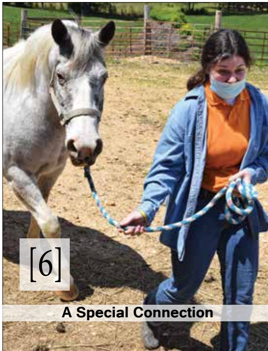
A Special Connection