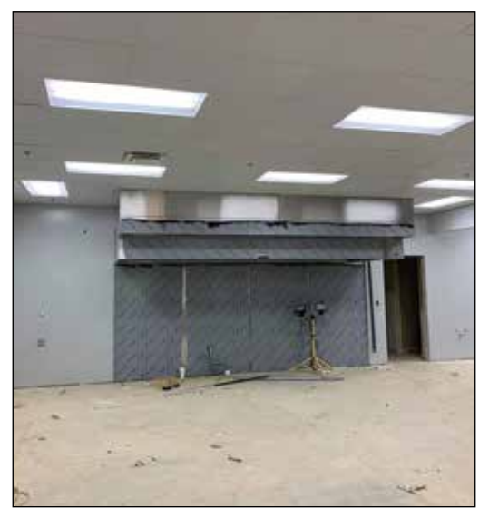
The kitchen of the new main building at The Ridge Retreat and Adventure Center.

Once completed, Children's Homes, Inc. plans to host a grandopening celebration to honor the many families and businesses who helped bring this project from dream to reality. The date of that celebration has yet to be determined because of the ongoing coronavirus pandemic. Once determined, we will post the date on all our social media sites.