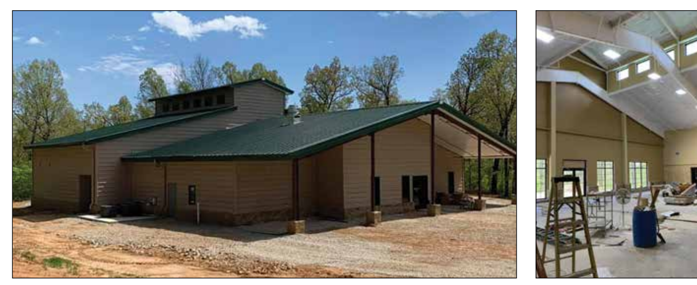
An outside and inside view of the new main building at The Ridge Retreat and Adventure Center.