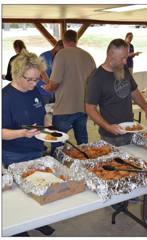
CLOCKWISE FROM TOP: A Homecoming guest grabs a cold tea from a member of a group of volunteers from West Plains, Mo.; Guests fill their plates; Two of our children in care admire the dessert spread in their family home; A young guest holds onto a full coinbank she planned to hand off.